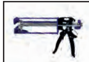
10:1 - 490ml GUN - M1