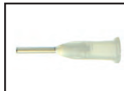
1314ST - White