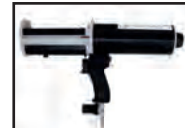
10:1 & 1:1 - Pneumatic