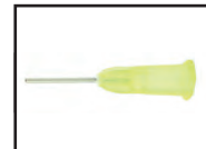
1320ST - Yellow