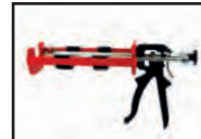
1:1 - 400ml GUN - M1